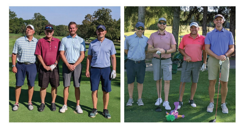
Photos left to right: Park National Bank team, Lighthouse Management team.