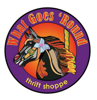
115 N. Main St., Mansfield, OH 44902

Hospice of Richland County and Life's Seasons Palliative Care 2131 Park Avenue West (Suite 400) Mansfield, Ohio 44906